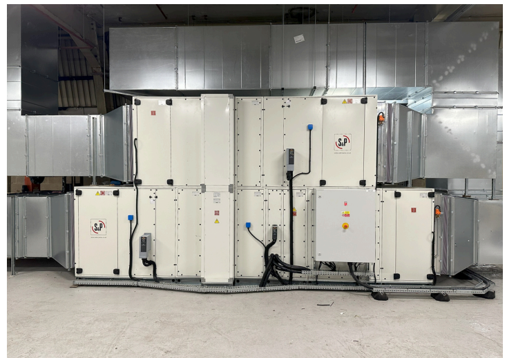
Second DUOVENT hooked up and ready to go