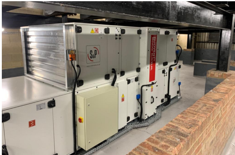
First DUOVENT rebuilt behind the brick wall

Mechanical Engineer at Workspace Build Ltd