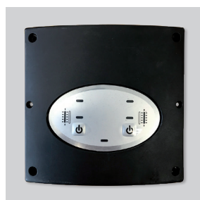
Panel de control