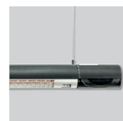
Can be installed on the ceiling and on the wall.