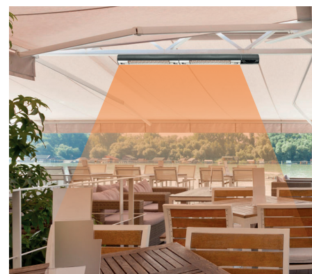
Installation under the awning.