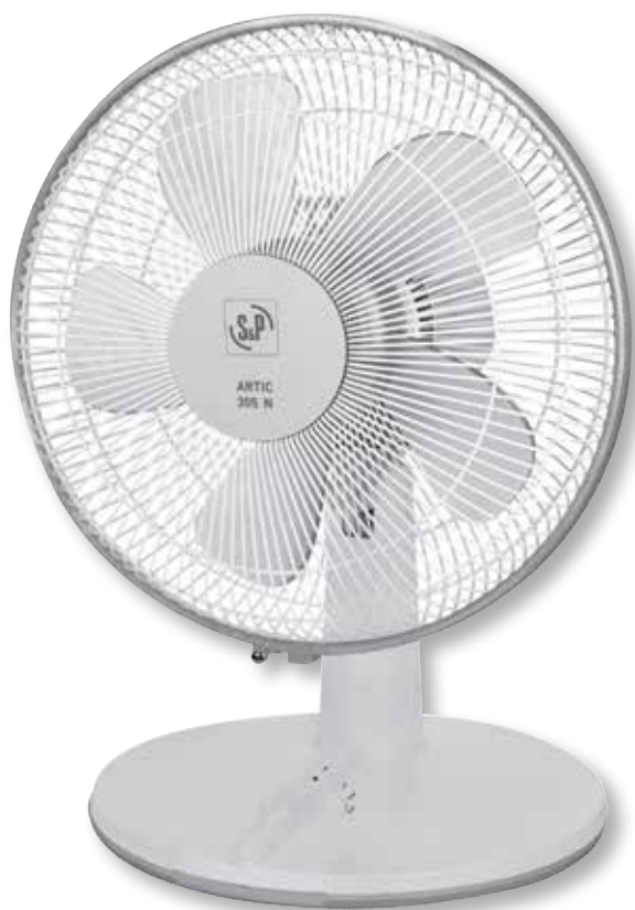
Table fans designed to offer a powerful and uniform distribution of air with a very quiet operation.